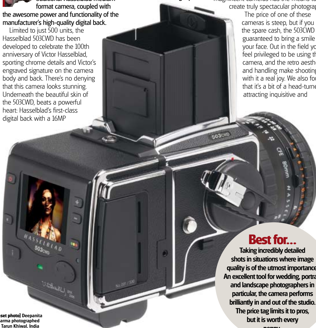
[Inset photo] Deepanita Sharma photographed by Tarun Khiwal, India

The 503CWD offers flexibility when it comes to storage solutions, with a choice of shooting to a CompactFlash card, to the optional Imagebank, or tethered to a PC or Mac. FireWire 800 output ensures speedy performance in the studio and, if you're out in the field, the 2.2-inch OLED screen is a formidable tool. It offers a wide viewing angle and performs well in bright conditions, although it could perhaps be improved further with an anti-reflective coating. The colours it reproduces aren't always entirely accurate, yet it's excellent for inspecting sharpness and the histogram provides a quick way of checking your exposure. To be fair, you can't really expect a relatively