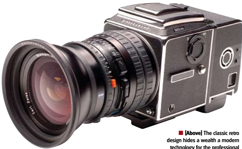
■ [Above] The classic retro design hides a wealth of modern technology for the professional

small screen to show off your images in all their high-resolution glory anyway. That pleasure is reserved for later, when you view your shots on the computer screen or, even better, on paper. The prints from this camera are exquisite, with tremendous detail and incredibly accurate colour and texture rendition.